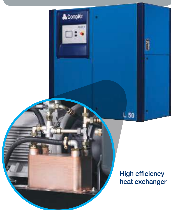
High efficiency heat exchanger