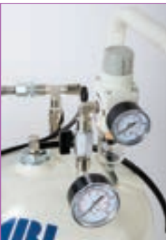
10 Micron Outlet Filter and Adjustable Pressure Regulator

For an even lower maintenance solution, all of the PT compressors can be fitted with an auto-drain – avoiding the manual draining of condensate in the receiver.