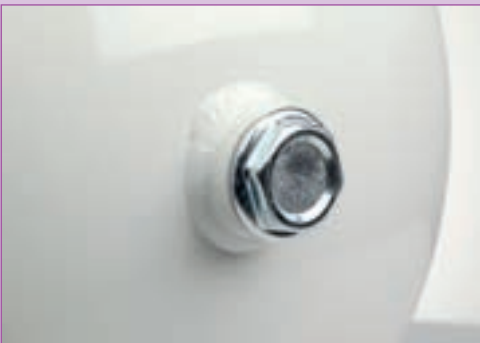
Internally Coated Receiver

Every PT compressor is protected by a comprehensive 12 month warranty extending to 5 years on the air receiver.