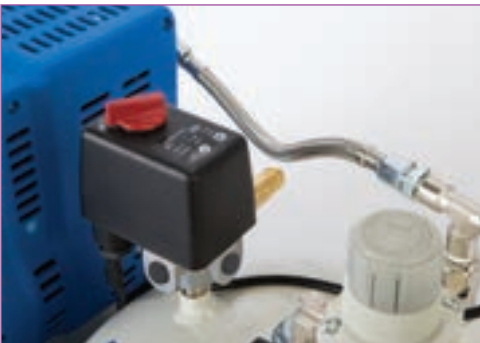
Condor Pressure Switch