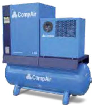
Complete airstation including compressor, dryer and receiver