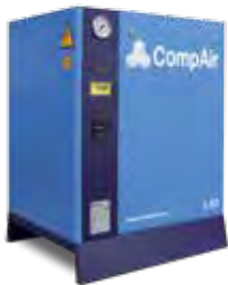
Compressor base mounted