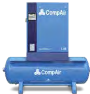
Receiver mounted compressor