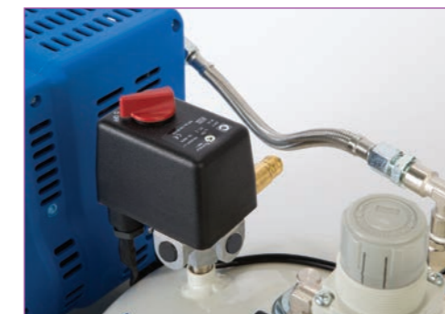
Condor Pressure Switch