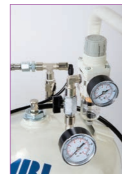
10 Micron Outlet Filter and Adjustable Pressure Regulator

For an even lower maintenance solution, all of the PT compressors can be fitted with an auto-drain – avoiding the manual draining of condensate in the receiver.